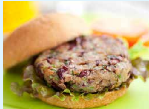
Beanie Burger ►