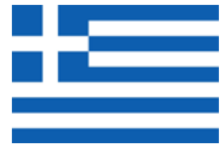
The Greek flag