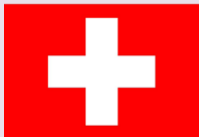
The flag of Switzerland

There's a city called Oatmeal, Texas , about 50 miles northwest of Austin.