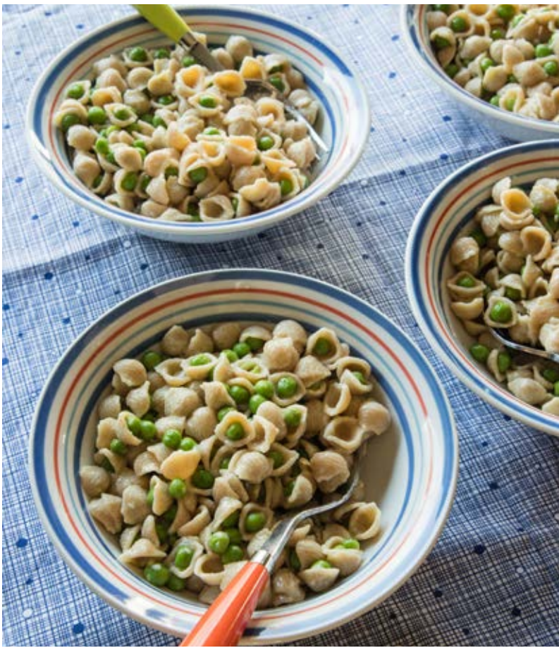
Pasta with Peas