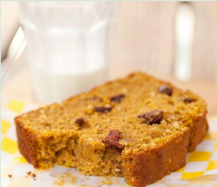
Pumpkin Loaf with Raisins and Dried Cherries