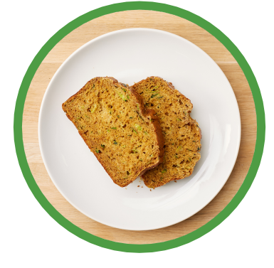
Zucchini Pumpkin Bread