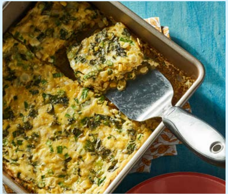
Corn and Basil Frittata